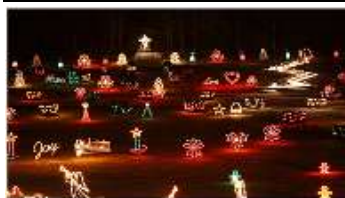
68th Annual Festival of Lights 2019